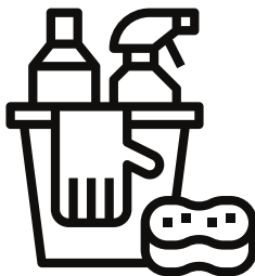
Cleaning courts & other external areas