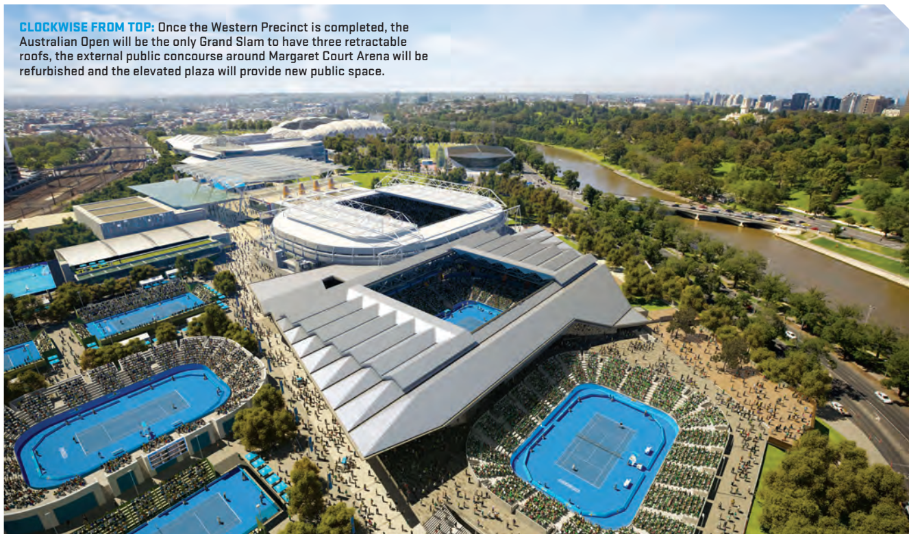
CLOCKWISE FROM TOP: Once the Western Precinct is completed, the Australian Open will be the only Grand Slam to have three retractable roofs, the external public concourse around Margaret Court Arena will be refurbished and the elevated plaza will provide new public space.

Construction on Stage 1 of the Melbourne Park redevelopment is expected to be completed in time for Australian Open 2015.