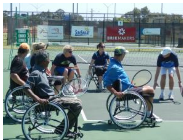
Wheelchair Tennis at the State Tennis Centre