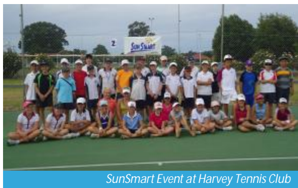
SunSmart Event at Harvey Tennis Club

The following clubs received the Country SunSmart Grant: Dunsborough, Perenjori, Northam, Spalding, Chapman Valley, Cunderdin, Kukerin, Lawley Park, Lesmurdie, Kojonup, Moorine Rock, Kondinin, Goomalling, Moodiarrup, Beverley, Denmark, Bridgetown, Hyden, Toodyay, Tarcoola Park, Mingenew, Gnowangerup, Harvey, Moore District, Wagin and Dudinin.