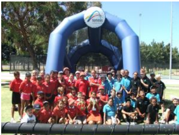
2012 Harmony Day Tournament

In addition to the round robin tennis challenge, each school was invited to put their serving skills to the test, with the Inflatable Speed Serve. All participants received a gift for their participation and were invited to a BBQ and presentation. Overall, the event was a huge success, with 2 more schools competing compared to 2011 and was enjoyable for all involved. All schools received funding support to cover costs of the teacher relief and bus travel.