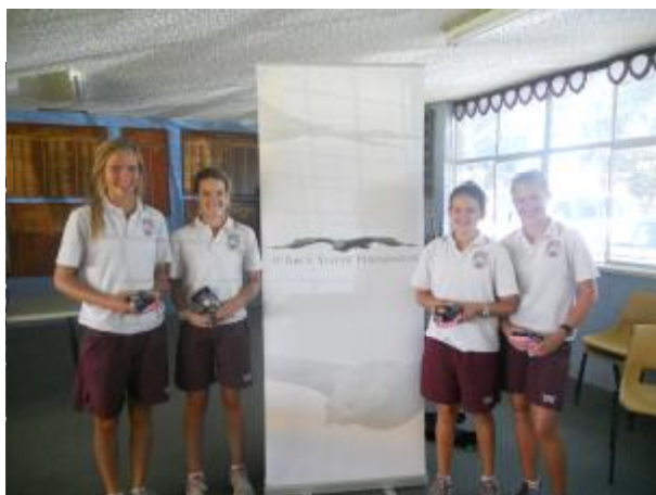
Girls Mursell Shield Winners: Mackillop College