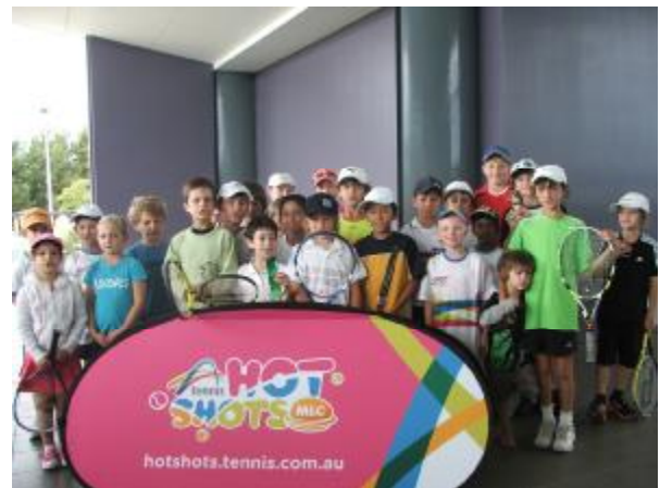
Festival of Tennis Hot Shots Challenge Event

A MLC Tennis Hot Shots Challenge Event was also aligned with the inaugural Festival of Tennis held at the State Tennis Centre in November. This event helped to showcase the Hot Shots brand, and provided the participants with a fun 'first tournament' experience. Participants were invited to take part in the festival activities after the challenge event, and parents were encouraged to try-out the new National Adult Program, Cardio Tennis whilst their children competed in the Challenge Event.