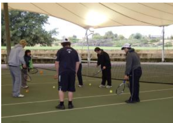
ID Program at the State Tennis Centre

The weekday program at the State Tennis Centre has proven to be one of the most popular programs on offer. This program is specifically targeted at adults and has doubled in participant numbers since its inception twelve months ago. With the continued increase a second timeslot was introduced.