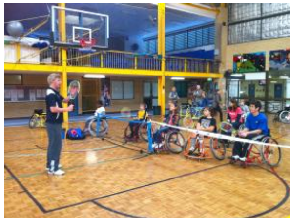
Adult Social Tennis Program at Wheelchair Sports WA

at the State Tennis Centre. This program continues to receive funding support from Healthway and Tennis Australia.