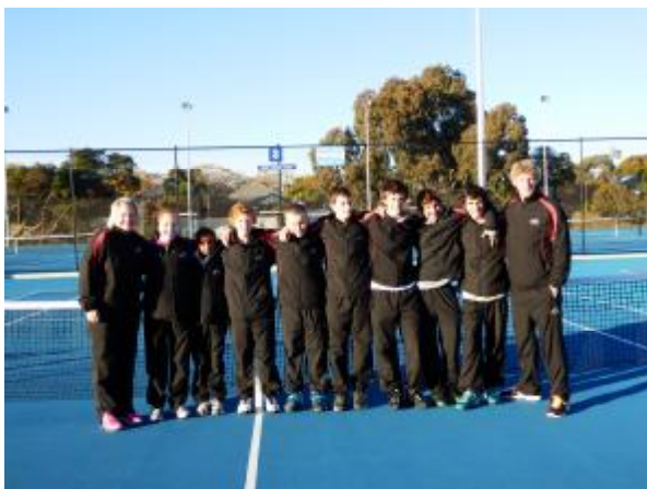
The Tennis West Regional Talent Development Program