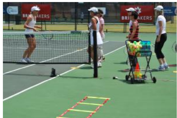
Festival of Tennis at the State Tennis Centre