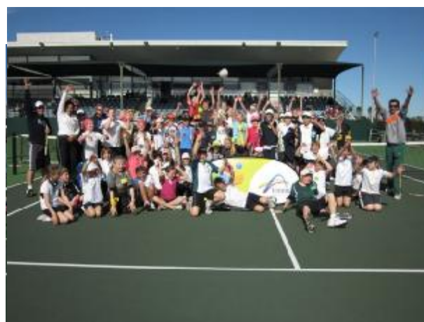
2011 Women in Tennis Active Girls Live in Camp

Finally Tennis West would like to thank both the Women in Tennis Committee and the D'Arcy Slater Foundation for their very generous support of this camp.