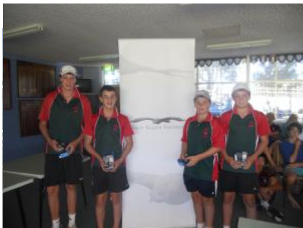
Boys Mursell Shield Winners: Kearnan College

Academy Plate: St Josephs Primary School, Bunbury Herbert Edwards Cup (Boys): Kearnan College Herbert Edwards Cup (Girls): Nagle Catholic College Mursell Shield (Boys): Bunbury Catholic College Mursell Shield (Girls): Mackillop Catholic College