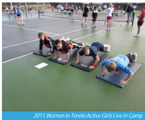
2011 Women in Tennis Active Girls Live in Camp