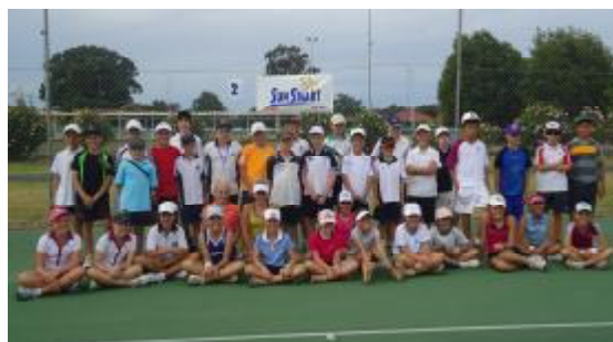
SunSmart Event at Harvey Tennis Club

The following clubs were successful in their application for a Country SunSmart Grant: Toodyay, Kindinin, Moorine Rock, Kulin, Kalannie, Ardath, Tarcoola Park, Gnowangerup, Harvey, Dudinin, Wagin, Ravensthorpe and the Upper Great Southern Zone.