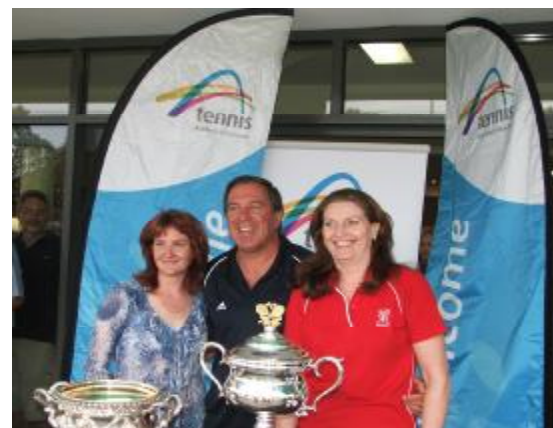
Australian Open Trophy Tour at Reabold Tennis Centre

In the 2011/12 financial year we are planning on more forward momentum for the Regional Tennis Centres and for their regions.