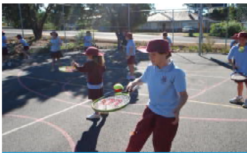
Hot Shots Clinic at St Mary's Catholic Primary School