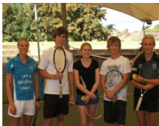
Trainee Coaching Course at the STC