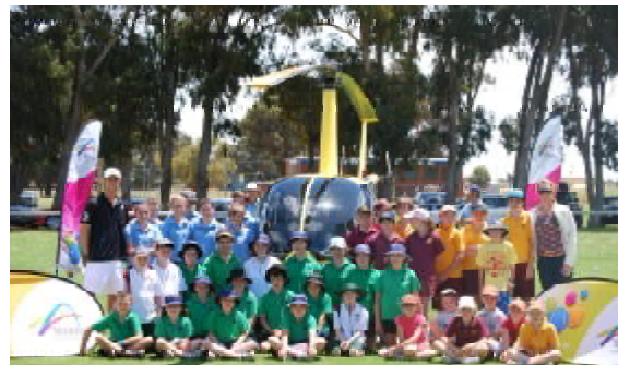
Esperance School Children with Alicia Molik