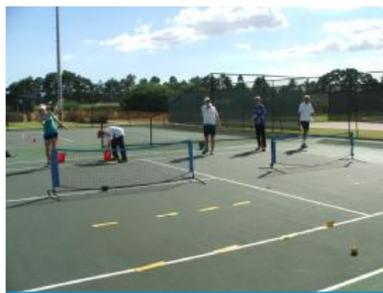
Introduction to MLC Tennis Hot Shots Course