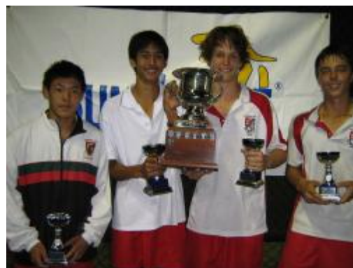
Boys Slazenger Cup Champions: Applecross SHS