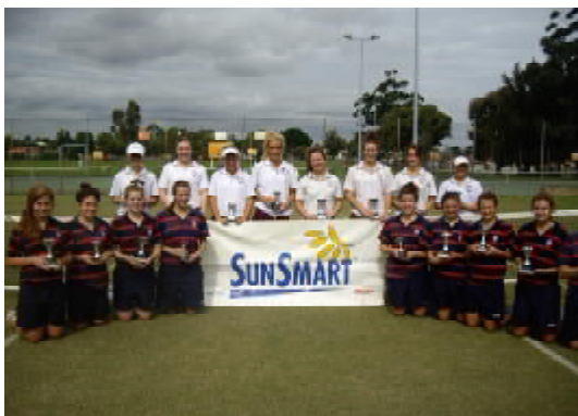
Girls Country School Classic Teams at Nollamara Tennis Club

The tennis throughout the play-offs and the Finals was of an exceptional standard, and all participants, teachers and parents were organized, enthusiastic and above all, passionate about their tennis.