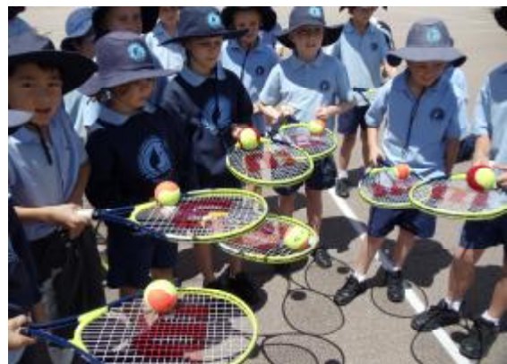
Hot Shots Clinics at Esperance Tennis Club