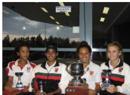
Girls Slazenger Cup Champions: Applecross SHS

By securing wins in the Boys and Girls events, Applecross SHS now have the opportunity to represent WA in the National Schools Sport Teams Competition in Wagga Wagga