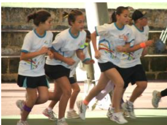
Camp participants undertaking fitness drills

The WIT Committee are available throughout the year to sponsor country clubs to assist with the coaching costs of young girls in the country regions. Applications can be made online through the WIT website.