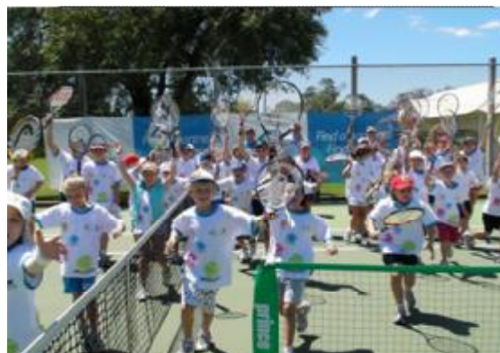
Hot Shots Challenge Event at Mosman Park Tennis Club

The country challenge events at Mingenew and Kojonup were particularly well received with 80 participants enrolled at each venue. Both clubs used the challenge event to conclude the coaching term and provide the participants with a first tournament experience.