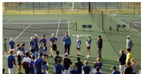
100 Club Academy Training and BBQ Night