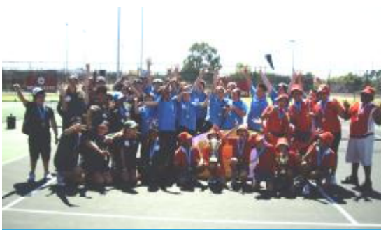
2011 Harmony Day Tournament

All participants received a prize for their participation and were invited to a BBQ and presentation at the conclusion of the tournament. Overall, the event was a huge success and an enjoyable experience for all those involved. All schools received funding to cover bus travel and teacher relief.