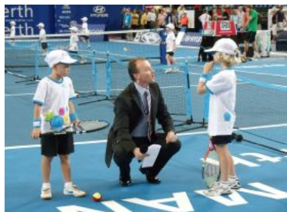
MLC Tennis Hot Shots Promo at the 2011 Hopman Cup

Tennis West actively participated in a number of Community Tennis Days and events around the state to promote and encourage people to play tennis. Tennis West provided a Tennis information stand and "have a go" station to engage the public in tennis. These community events capture a wide audience, with people attending from all over WA. There were over 2500 participants across a number of community days, including large scale event such as: Seniors Recreation Day, Christmas Pageant, Hopman Cup Family Day/Interactive Zone and the World Sports Expo.