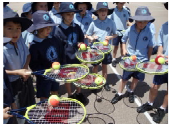
Community Engagement program at Kalgoorlie