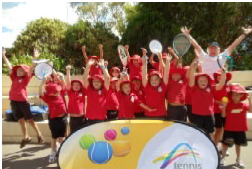
Hot Shots Clinic at Dandaragan Primary School

Australind Primary School Margaret River Primary School Yallingup Steiner School Karridale Primary School Augusta Primary School Bridgetown Primary School St Mary's Catholic Primary School, Boyup Brook