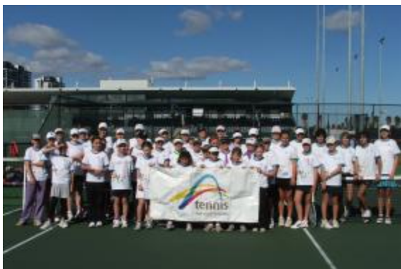
WIT Active Girls Live in Camp participants

Women in Tennis have been sponsoring this event since its inception, and are pleased to offer such a great opportunity for young regional female tennis player.