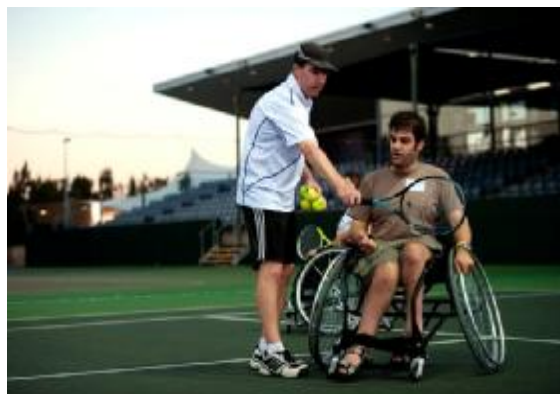
Wheelchair Tennis Come and Try Evening at the State Tennis Centre

The free 6-week group coaching program was promoted and delivered in collaboration with Wheelchair Sports WA, who marketed the program to their extensive database of participants. At the conclusion of the program a mini-tournament was held for all players.