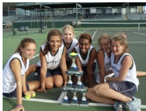
Girls Herbert Edwards Cup Div. 2 Winners