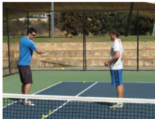
Club Professional Coaching Course at the STC

A combined total of 56 participants took part in Introduction to MLC Tennis Hotshots course across the following venues: Central TAFE, St Stephens Carramar, Perth, Albany, Kalgoorlie, Cowaramup, Esperance, Geraldton and Busselton.