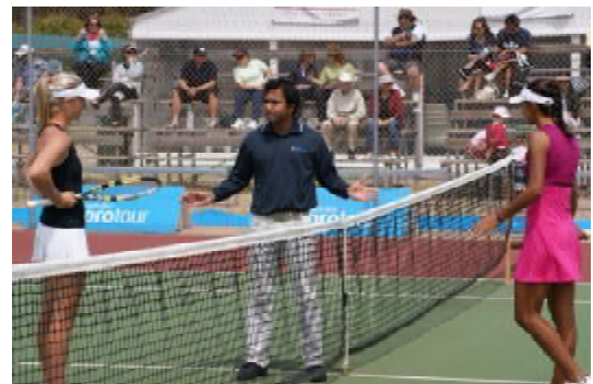
Female players at the Esperance Tennis International