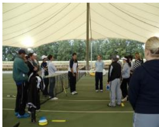
Club Professional Coaching Course at the STC