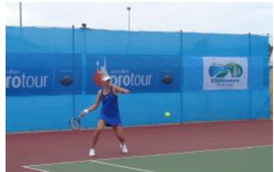
Alicia Molik at the Cliffs Esperance Tennis International