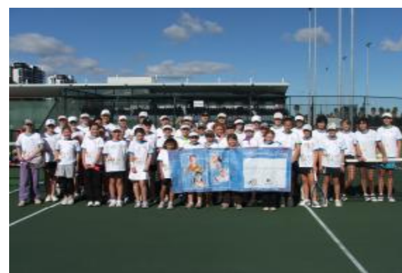
2010 Women in Tennis Active Girls Live in Camp

On the final day of the camp the girls participated in a mini-tournament, allowing them to put their newly acquired skills to the test. The camp concluded with a presentation and sausage sizzle attended by all coaches, participants, family and friends.