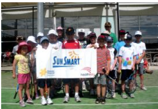
SunSmart Junior Tournament at Next Generation Perth South

All successful clubs were provided with a SunSmart pack consisting of a SunSmart sign and Sunsmart collateral to use as prizes and giveaways at the event.