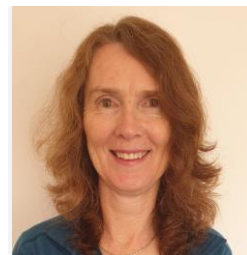
Lita Trimmings Tournament Staff