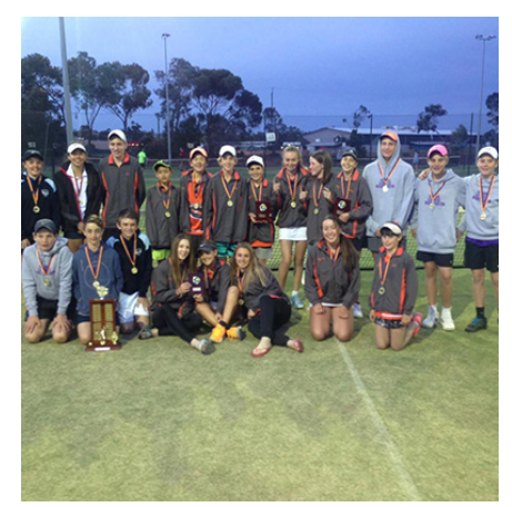
Foundation Cup Training