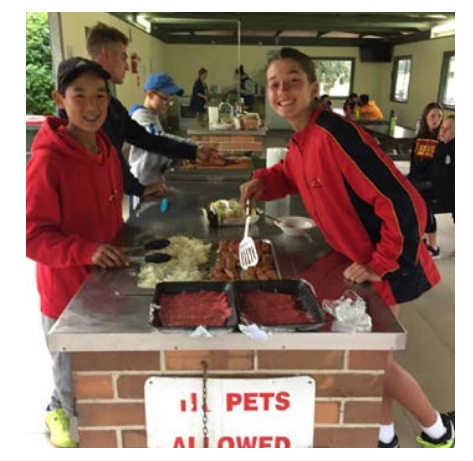
12/u players cooking whilst on camp