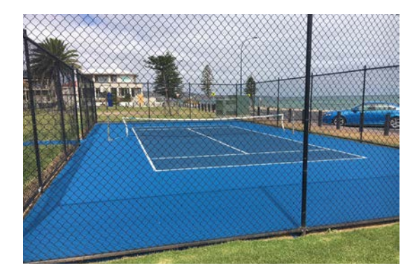
Upgraded 'half court' tennis court at Wattle Reserve, Hove.