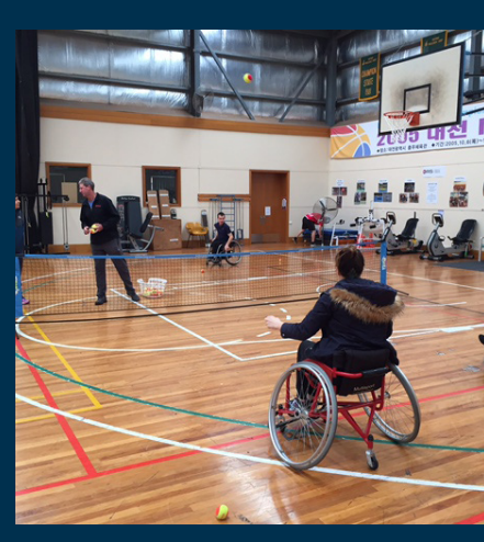
Wheelchair Tennis Program participants