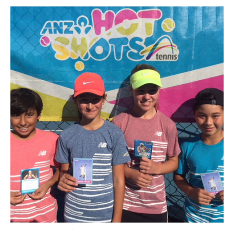
Super 10s trials

A new selection and trial process has been implemented using local identified and promoted tournaments as a guide