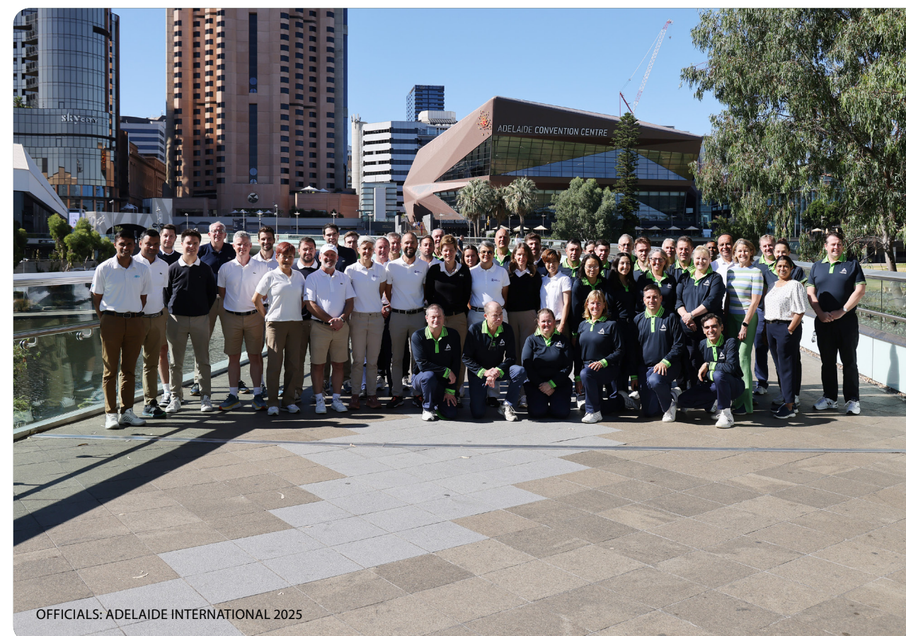
OFFICIALS: ADELAIDE INTERNATIONAL 2025

training and advice was presented to several junior associations giving clubs the confidence to enable a safe environment and the greater South Australian tennis community. Parent education training continued at the younger junior level at Super 10's sessions and National Development Squad level. This is a combined initiative of Tennis SA Tournament, Competitions and Officiating and High Performance. Clubs were supported on complaint handling and minor matters, as well as educated in improving and maintaining parent and spectator behaviour. Compliance with national policies and state government legislation through appropriate screening and Child Safe environments further accentuate the emphasis on all participants feeling safe in our tennis environments. South Australian Government Working with Children Legislation continued to be communicated to all clubs and associations in South Australia in accordance with Child Protection in Tennis. The Member Protection, Safeguarding Children Code of Conduct and Code of Behaviour Policies were also enforced through investigation, management and support of player, parent and spectator behaviour.