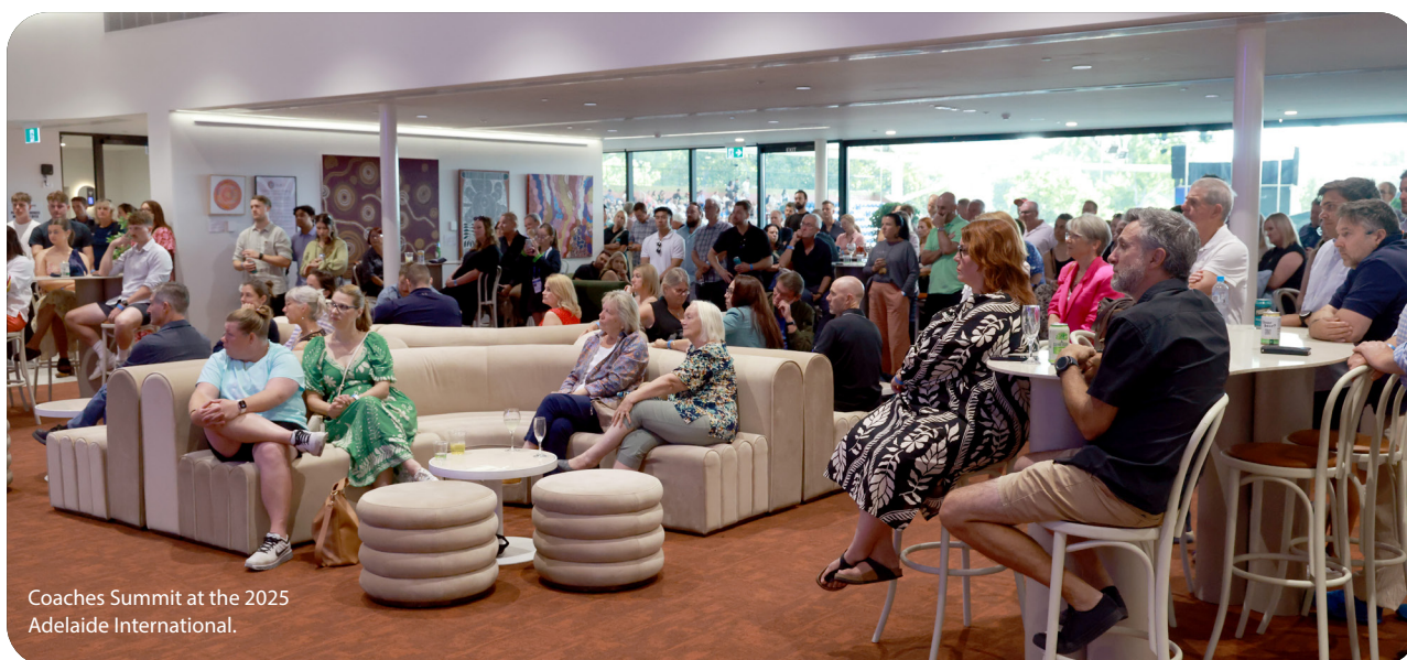
Coaches Summit at the 2025 Adelaide International.

The total number of coach members for the 2024–25 was 267, 58 business, 69 Qualified and 140 Trainee members.