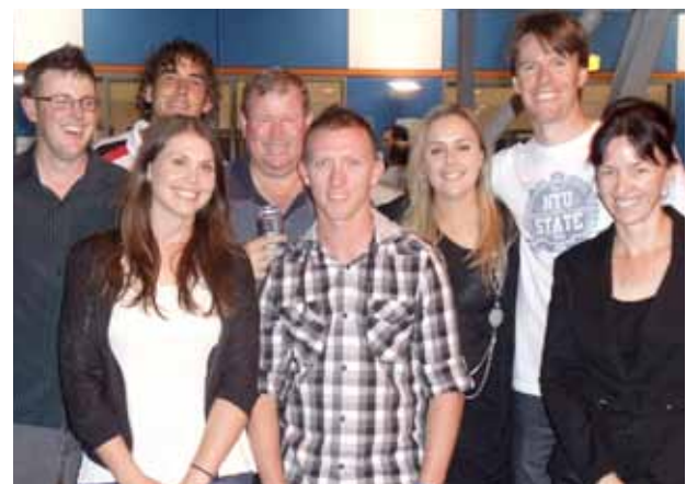
Community Tennis Officers