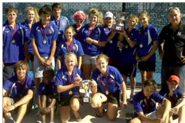
2010 JMC State Finals Winners