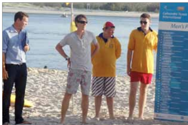
Caloundra Challenger Event