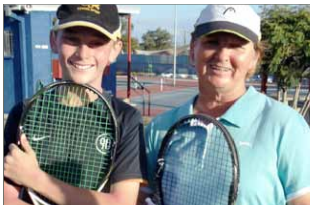
Enjoying the new Rockhampton Regional Tennis Facility

The Rockhampton Regional Tennis Centre- Victoria Park officially opened on October 23. Since this date, the facility has hosted a number of tournaments including the Queensland State Age Championships and CQ Junior Development Series Circuit and Finals events. Gladstone and Bundaberg also each held an AMT event, with Bundaberg also hosting a prestigious Pro Tour event.