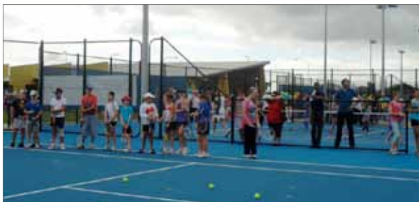
Townsville Tennis Centre Opening

Project consisted of ten (10) Plexipave courts and a substantial single level Clubhouse within the new Kalynda Chase residential estate in Townsville's western suburbs. The ownership of the land on which this facility stands was essentially gifted by the developers (Lancini Group and Urbex) to the Townsville City Council. The early onset of the wet season in North Queensland and Tropical Cyclone Yasi delayed completion of the works until June 2011 with the Official Opening held on 17 July 2011 in conjunction with a Junior Development Series tournament held at this facility. LifeTime Tennis was appointed as the Professional Operator of this facility following an open tender process in late 2010.