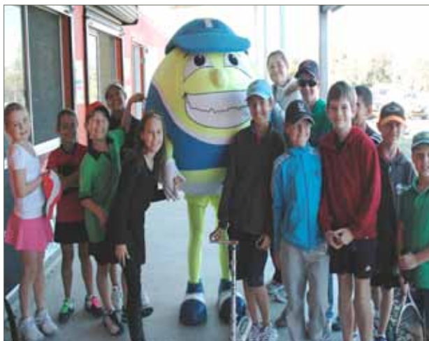
Terry Tennis Ball with Junior Tournament Players

All tournaments can use Tournament Planner's online entry function to ensure effective and efficient management of events.