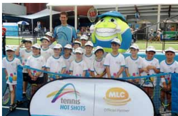
MLC Tennis Hot Shots

MLC Tennis Hot Shots saw 248,013 children participate in the program nationally, with approximately 50,000 from Queensland. Tennis Queensland also increased MLC Tennis Hot Shots opportunities by providing further funding in regional and remote locations. MLC Tennis Hot Shots is also incorporated into disability, indigenous and multicultural inclusive programs to provide a positive playing experience for all participants.