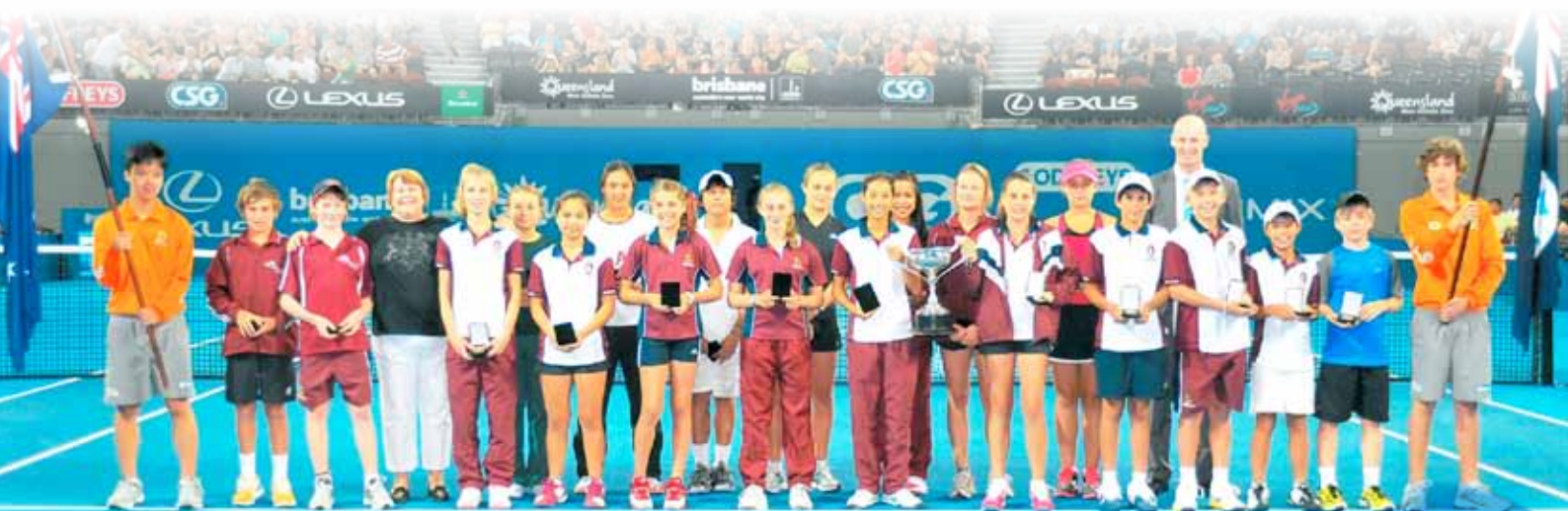
Future Champions Presentation – Brisbane International