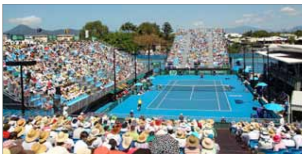
Australia v Belgium Davis Cup Tie

The new regional centre has reinvigorated tennis in the far north, with an increased number of participants in both MLC Tennis Hot Shots Challenges and Junior Development Series participants. Also, for the first time in 10 years, Cairns played host to an Australian Pro Tour Event.