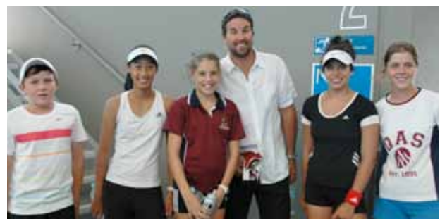
Pat Rafter with National Academy Athletes