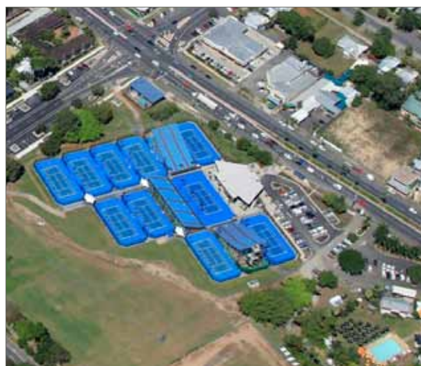
Cairns Regional Tennis Centre

Project consisted of twelve (12) Plexicushion courts and an impressive two (2) storey Clubhouse located on a prominent site within the North Cairns Sporting Reserve. The construction of both the courts and the Clubhouse was completed in August 2010 with LifeTimeTennis appointed as the Professional Operator of this facility. The Cairns Regional Council invested more than $3 million into this project to develop arguably the best Regional Tennis Centre anywhere in Australia, and is a reflection of their support for tennis in the Cairns region. The Official Opening for this facility was held during the Cairns International Pro Tour event and in conjunction with the Davis Cup Play Off against Belgium held at this facility the following week.