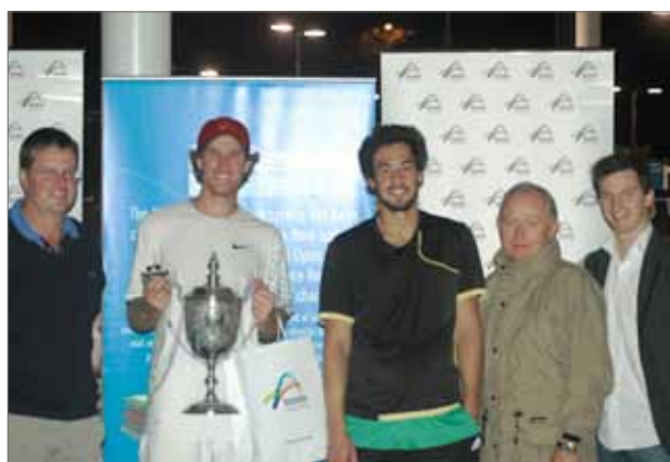
Plexicushion QLD Open Mens Final