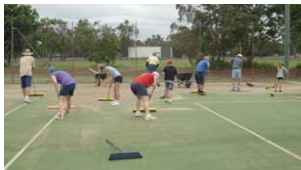
Flood clean up at Chinchilla & District Tennis Association