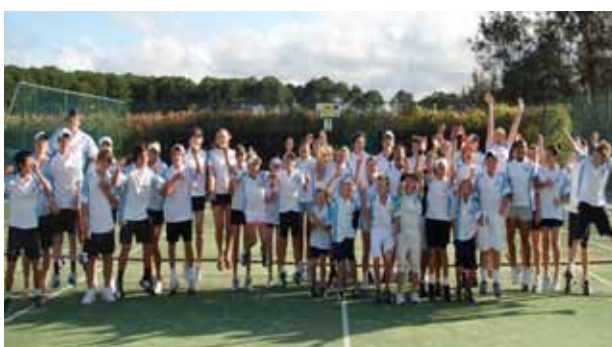
2010 QLD Junior Teams Carnival winners

The new 8 courts at Challenge Tennis Club was officially opened after years of planning and patience. This venue has been a fantastic result for the region with many new junior and senior players taking to the hard and grass courts.