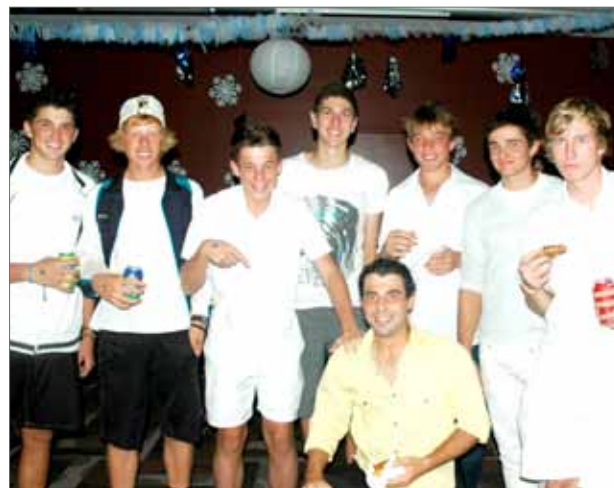
Winter Wonderland Player Party

It was great to see the fruits of this labour with great crowds in attendance at the "White Party," the Plexicushion QLD Open Twilight Finals, and Tennis + Gear Online Rod Laver Championships Defrost BBQ Finals day.