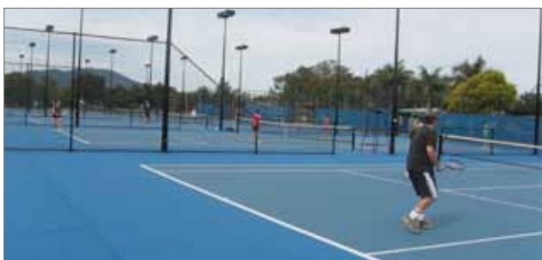
Rockhampton Regional Tennis Centre

Project consisted of the demolition of twenty (20) existing courts at the Victoria Park Tennis Centre and construction of nineteen (19) new Plexipave courts, plus a new single level Clubhouse located on the embankment between these new courts. Construction works for the courts were completed in March 2010 and the Clubhouse was completed in October 2010 ahead of the Official Opening in conjunction with the Junior Masters Series Finals held at this facility in late October 2010. The Rockhampton Regional Council appointed a local consortium Tennis Rockhampton Limited as the Professional Operator and this tenure commenced in January 2011.