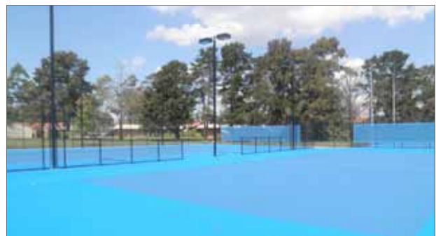
Toowoomba Regional Tennis Centre - USQ

Project consisted of the demolition and reconstruction of two (2) existing courts so as to have a total of eight (8) matching Synpave courts, plus a much needed new Clubhouse. The works to the courts was completed in April 2009 and included the surfacing manufacturer (Rebound Ace) providing additional materials (at no cost to the project) to apply a fresh coat of Synpave to the other 6 courts at this centre so they were all in the same condition on completion of the project. The Clubhouse was completed in January 2010 and the Official Opening was held in March 2010. The Copper City Tennis Club separately appointed a new Club Coach (June 2010) and Facility Manager (March 2011) with the assistance of TQ and the State.