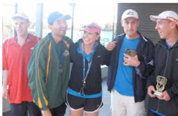
ID Queensland Open

The Queensland Disabilities program continues to grow and enhance partnerships with state disability sporting organisations.