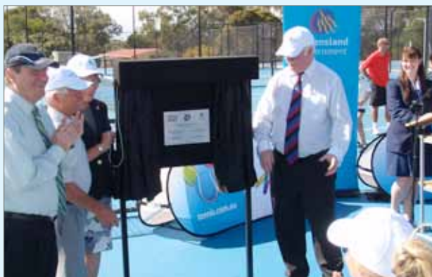
Official Opening of the Challenger Tennis Centre at Southport SHS

In Queensland, we have identified the indicative locations for approximately 15 Regional Tennis Centre, based primarily on current and predicted demographics and taking into account existing tennis facilities in these areas. In comparison with