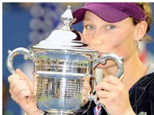
Samantha Stosur - 2011 US Open Singles Champion