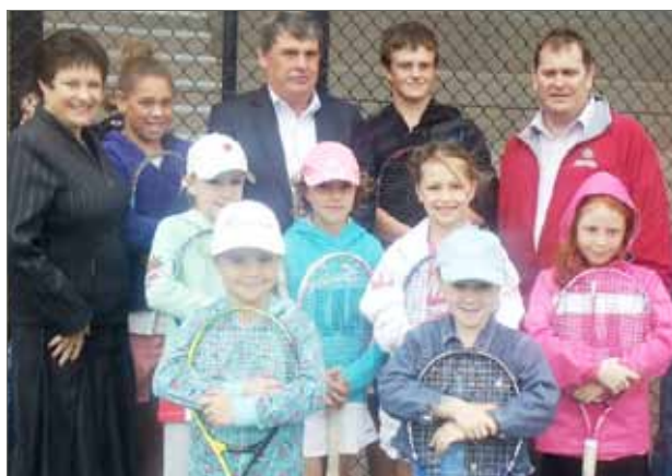
Redcliffe Tennis Centre Opening