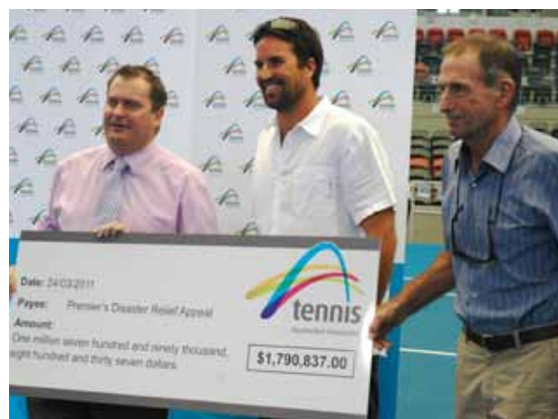
Handover of Money Raised for the "Premier's Disaster Relief Appeal"

At the Australian Open, the world's best tennis stars including Caroline Wozniacki, Ana Ivanovic, Justine Henin,