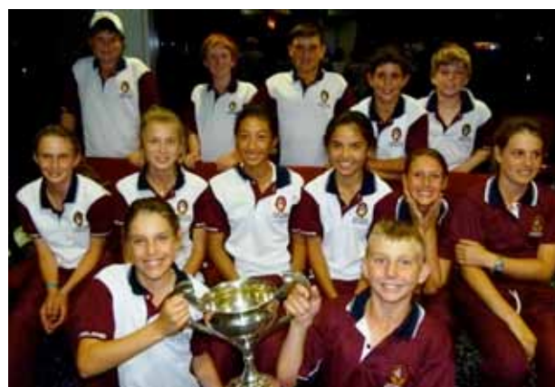
Queensland Team with Trophy