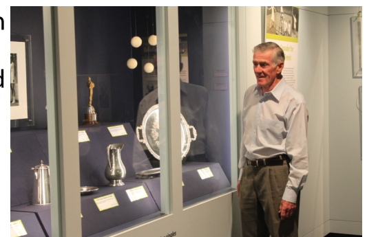
Ken Rosewall enjoying the exhibition

For more information visit our website: www.tennis.com.au/museum or phone the museum on (02) 9024 7629.