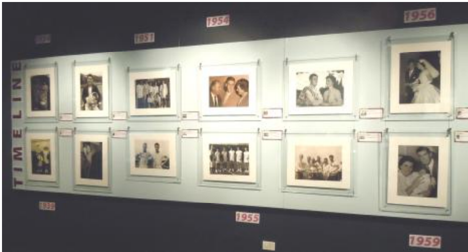
“Muscles—The Story of Ken Rosewall” Exhibition Timeline

“Very interesting and my grandpa knows some of the people in the photos!”