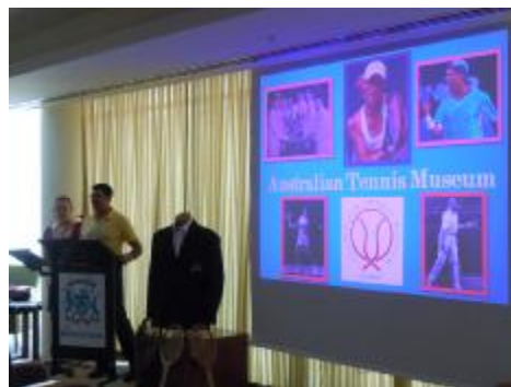
The screen presentation.