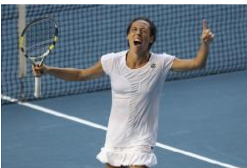
Francesca Schiavone after her enduring win in the fourth round against Svetlana Kuznetsova at the Australian Open 2011.