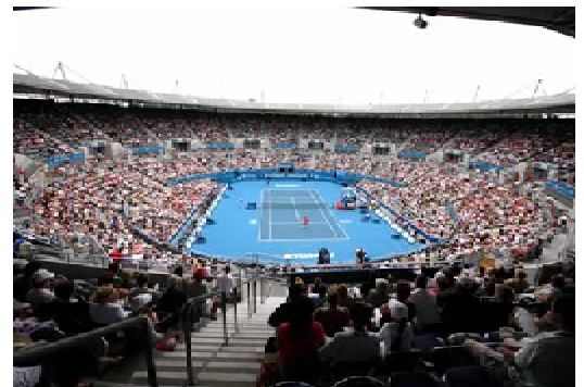
Walk on Ken Rosewall Arena as part of the Group Tours at the museum.