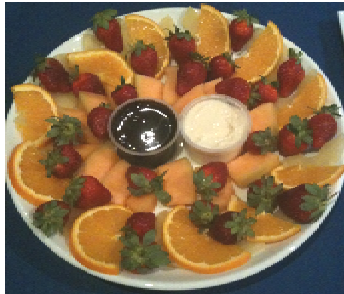
The nutritious fruit platter available on the Tennis Tea Party Tour.

Looking for an experience that your local tennis or social club will remember? Come visit the Australian Tennis Museum and get taken on a journey of Australia's Tennis History and Future!