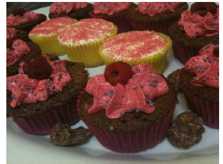
Some of the delicious treats available on the Tennis Tea Party Tour.

Why not contact the museum today to arrange a tour or to receive an information brochure.