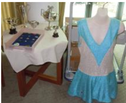
A display of some of the museums collection.

On Thursday 20th January 2011 the Australian Tennis Museum went on the road and visited the Sir Moses Montefiore Jewish Home. The museum brought collection items and presented a talk about both the Australian Open and museum. The experience was enjoyed by all the residents who attended, reminiscing about their past tennis experiences which were prompted by the hands on display.