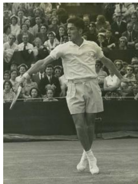
Ken Rosewall playing Jaroslav Drobný in the Men's Singles Final at Wimbledon in 1954.

This exhibition will be on display at the museum from 9th January 2011 until 30th November 2011.