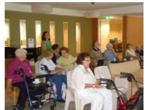
The residents of Sir Moses Montefiore Jewish Home enjoying the museum visit.