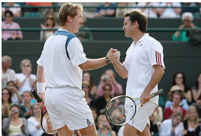
"The Woodies" were an unbeatable combination.

The partnership began in 1991 and resulted in 61 ATP World Tour doubles titles including 11 Grand Slam championships and two Olympic Medals (Gold in Atlanta 1996 and Silver in Sydney 2000). The boys won Wimbledon a record six times, were the ATP Doubles Team of the Year four times and represented Australia together in three Davis Cup finals.