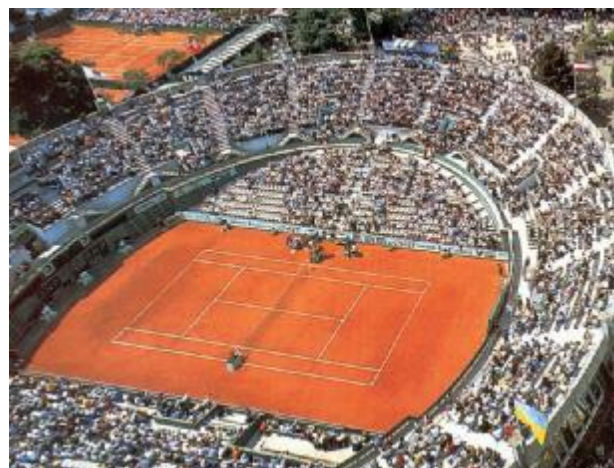
Roland Garros Stadium.

The original French Open Championships began in 1891 when only national players were allowed to enter the tournament. It wasn't until 1925 when it truly became an international event named "Championnats Internationaux de France." In 1928 the championships were moved to their current grounds at the Roland Garros stadium. The only Grand Slam held on clay, the championships have seen some fabulous matches and crowned many revered champions over the years.