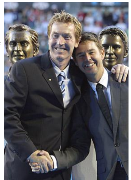
Mark Woodforde and Todd Woodbridge being inducted into the Australian Tennis Hall of Fame in January 2010.

Friends of the Australian Tennis Museum Newsletter Issue 6, August 2010