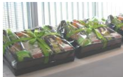
The Garnier Lucky Door Prizes