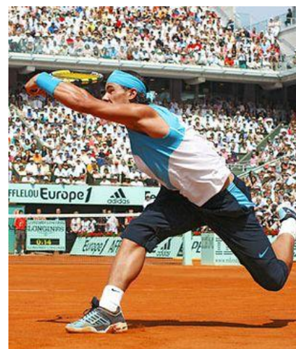
The King of Clay, Rafael Nadal.

This information has been compiled from material donated to the Australian Tennis Museum from the Tennisium - Musée Roland Garros.