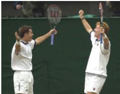
"The Woodies" during a moment of victory!

This year has proven an excellent year for the past dream team, "The Woodies" with two inductions into various Hall of Fames.