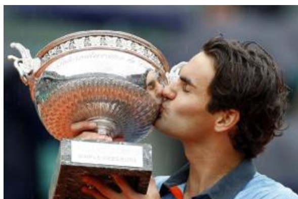
Roger Federer after his win in 2009.