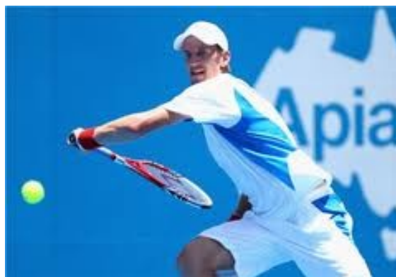
Jarkko Nieminen—Winner of the Apia International Men's Singles