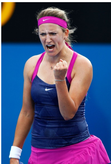
Victoria Azarenka—Winner of the Apia International Women's Singles

Any guesses as to who will be our special guest this year?