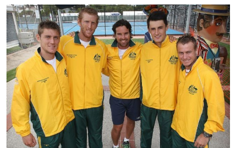
Australia's Davis Cup team at the Geelong Lawn Tennis Club