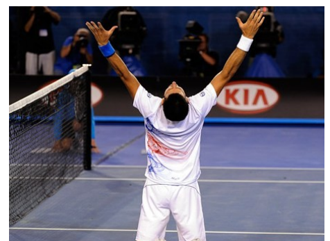
Djokovic wins the Australian Open

Friends of the Australian Tennis Museum Newsletter Issue 11, February 2012