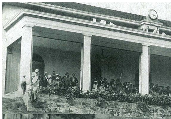
Earlier NSW Tennis Association building on New South Head Road, built ?.....TBA!