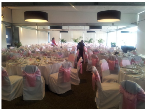
ABOVE: Catering staff add final touches to the table dressing with a pink chair sash.

A big thank you to all the wonderful museum volunteers and the Tennis NSW staff who help out during the Luncheon to create a wonderful event.