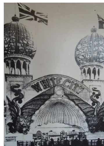
Gates to White City amusement park.

AUSTRALIAN TENNIS MUSEUM http://www.tennis.com.au/museum PO Box 6204, Silverwater, NSW, 1811