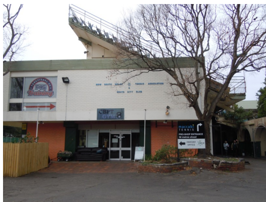
Later Tennis NSW Association & White City club house, off Alma Street, opened in 1970.