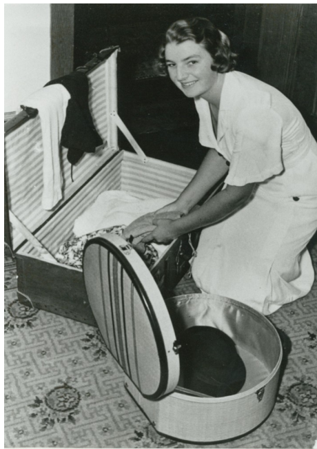
Packing for the Australian Women's Overseas Tour 1938