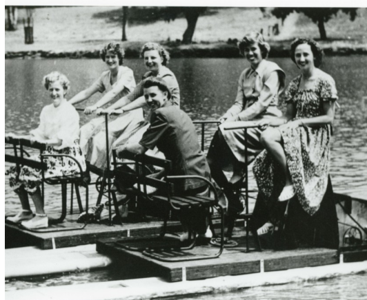
1949 January - on the River Torrens Adelaide - taking time out from the Australian Championships at Memorial Drive