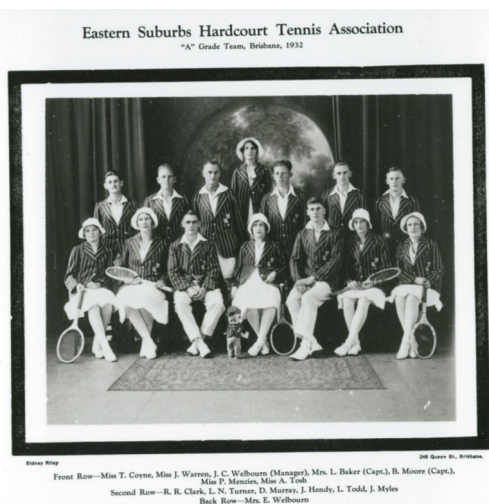
Eastern Suburbs Hardcourt Tennis Association "A" Grade Team, Brisbane, 1932