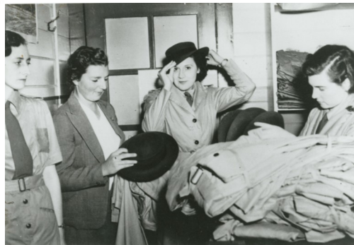
1942 February - enlisted Australian Women's Army Service (AWAS) - seen here at recruit training school, Melbourne