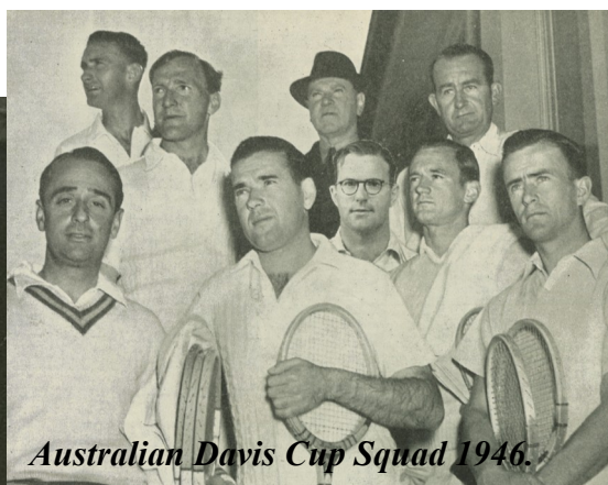
Australian Davis Cup Squad 1946.