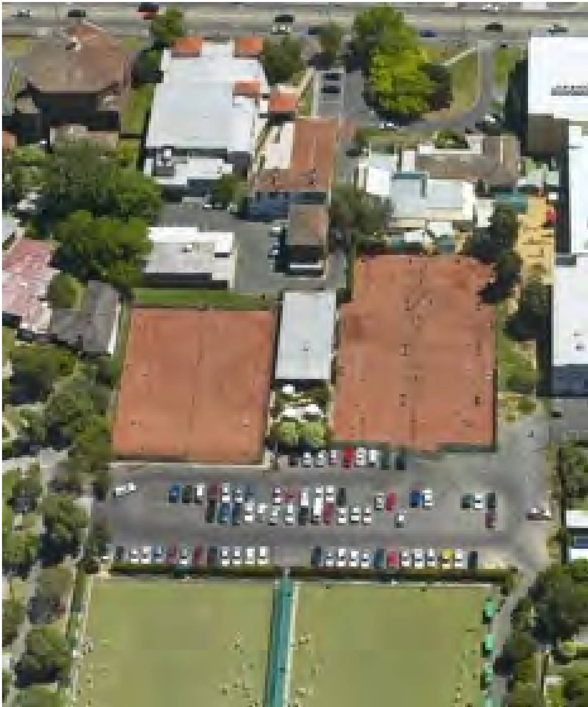
A last look at what have been our neighbours since 1968 – Library Meeting Room, Scout Hall, Peppercorn Club and the Child Care Centre