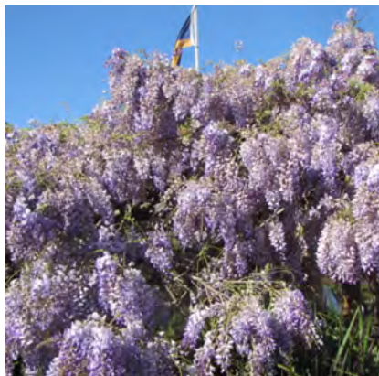
Our garden is always much admired