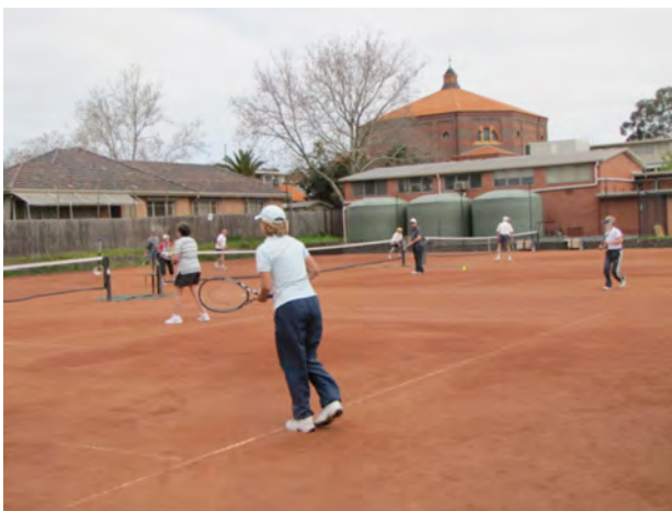
A busy morning on Courts 1 – 3: the view will change as the Precinct develops and our water tanks learn their fate