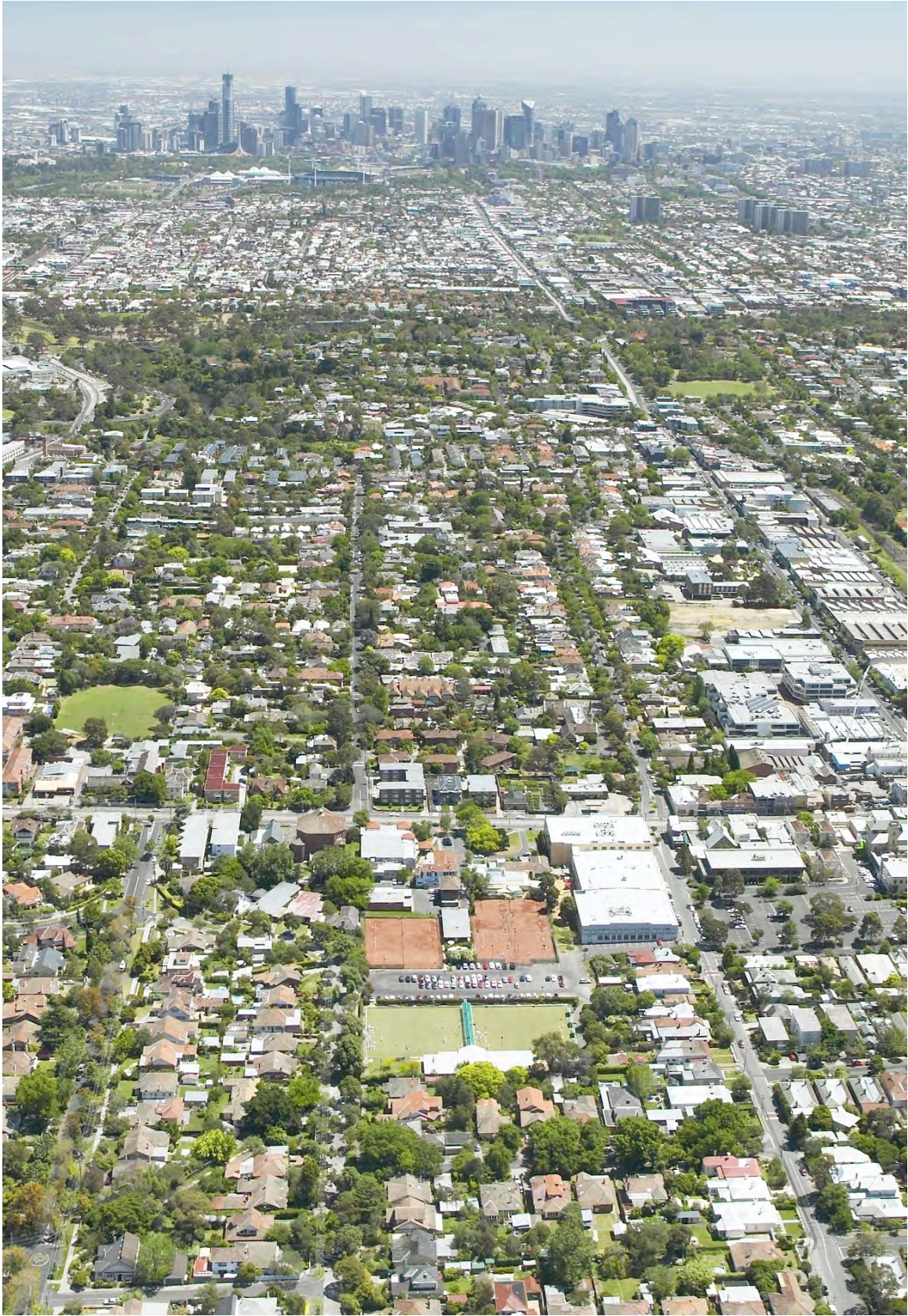
Hawthorn Tennis Club and our soon-to-be late neighbours: demolition of the old buildings around the Hawthorn Community Precinct will change our outlook