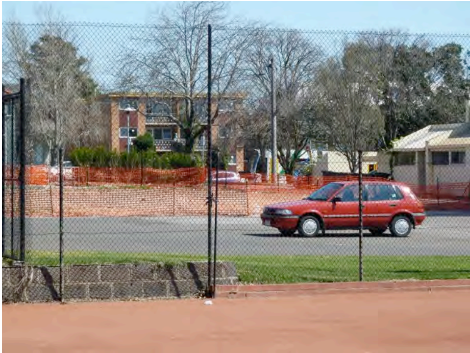
The Scout Hall went first; now the home to both Peppercorn Club and Italian Senior Citizens has gone. The new Precinct takes shape this year; so watch the trams while you can.