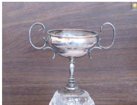
Howlong Tip to Hawthorn TC Trophy Cabinet

Have a look at this little piece of our history when next at the Club. And keep an eye out when next fossicking at your local tip.