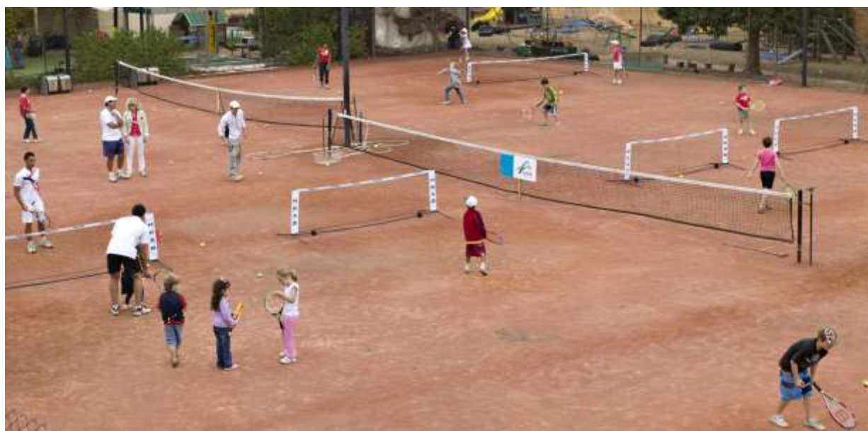
Mini tennis was a real hit at Open Day

The upcoming 2009-10 Summer season will see three boy's teams fielded. There will be a couple of new faces playing their very first season, which will be exciting. More and more juniors will be ready for competition by Winter of next year and the coaches are hoping to field a girl's team in the future. The aim is to perhaps field another two teams, one of them girls, for the Winter season of 2010.