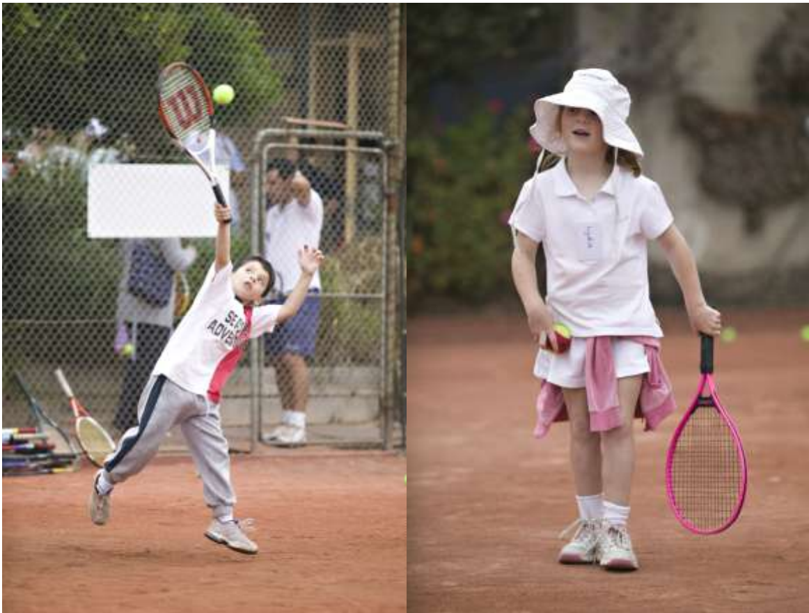
Australian Open, 2020s?