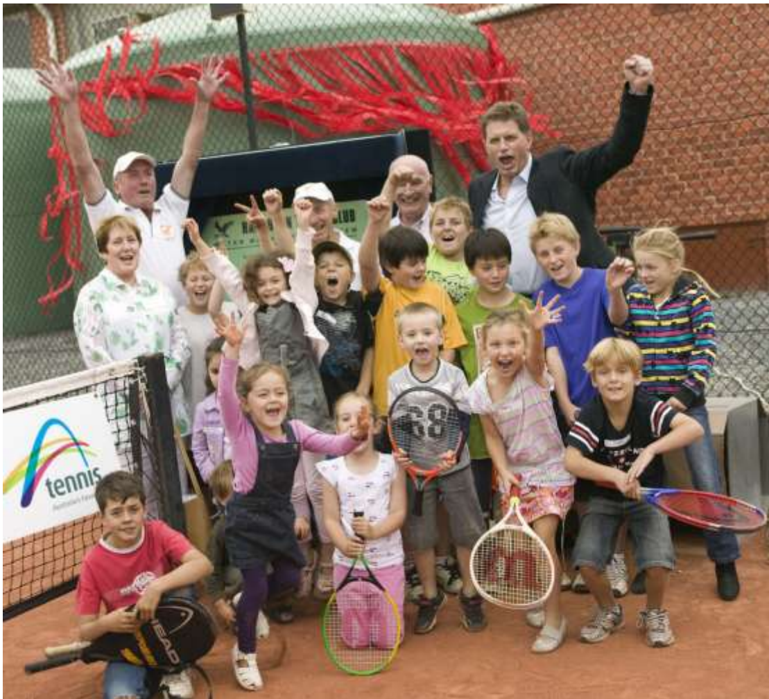
A big hand for Open Day