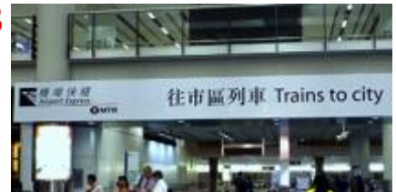
Follow signs to the Airport Express Train