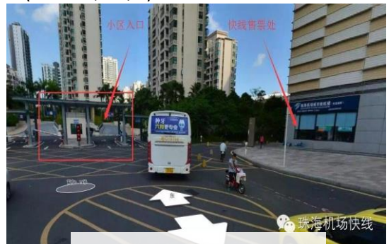
Huafa Mall Station