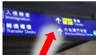
Collect your bags and proceed through immigration