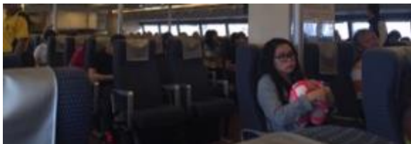
Purchase your ticket and take the ferry to Jiuzhou Port, Zhuhai