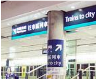
HK Express to Central

+ TRAIN TO CENTRAL + TAXI/TRAIN TO HONG KONG MACAU FERRY PORT + FERRY TO JIUZHOU PORT + Taxi to Chimelong Ying Hai Hotel & Apartments(hotel) Total journey time: 3 hours