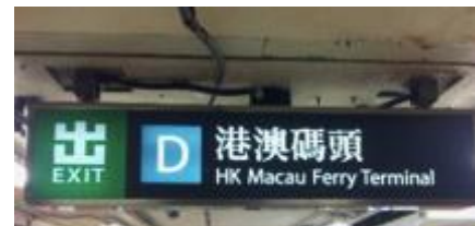
Then walk or cab to Hong Kong Macau Ferry terminal.

There are at least 7 FERRIES PER DAY from Hong Kong Ferry Port (Sheung Wan) to Zhuhai Jiuzhou Port: 8:30, 10:30, 12:30, 14:30, 16:30, 19:30, 20:30, 21:30