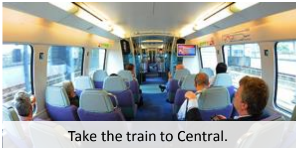
Take the train to Central.