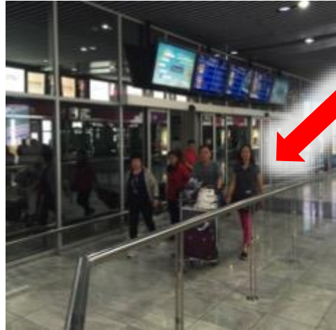
Only one exit