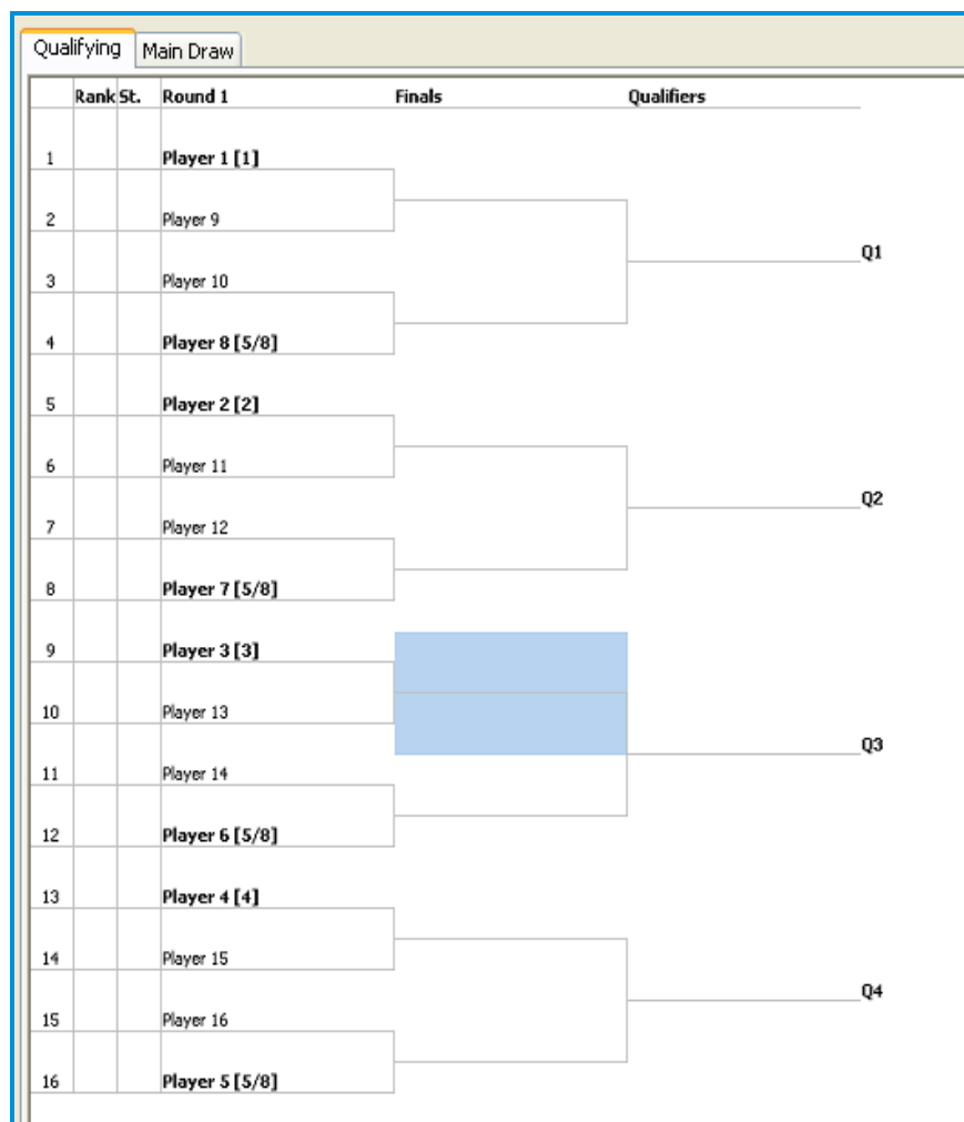
Figure2: Example of a 16 > 4 qualifying draw

The remaining unseeded athletes shall be randomly drawn and placed in the vacant places in the draw beginning at the top of the draw.