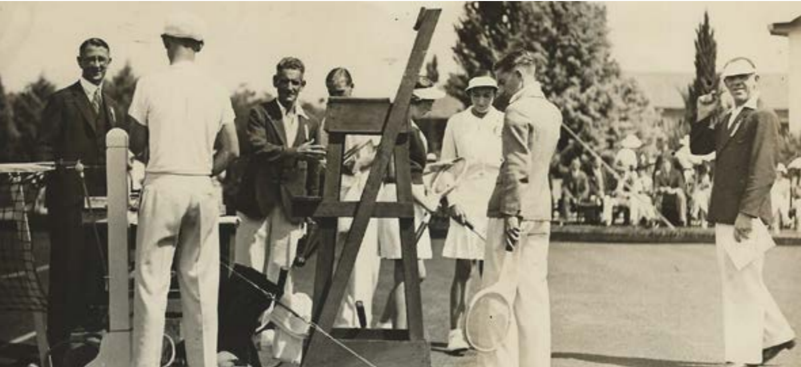
Exhibition at Hotel Canberra Bowling Green, 1935.

GROWTH YEARS: ACT IS 'OFFICIALLY TENNIS MAD'