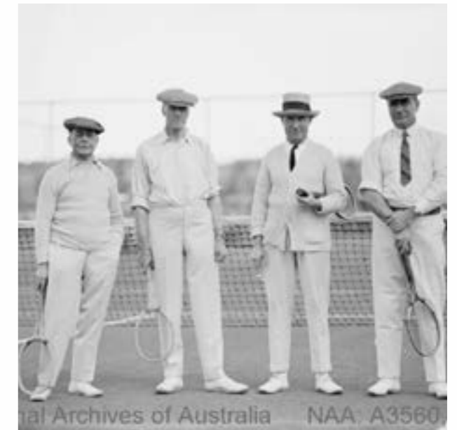
Manuka Tennis Courts Official Opening, 1928. (L-R), John Latham, Sir Littleton Groom, Dr Earle Page and Sir John Butters.