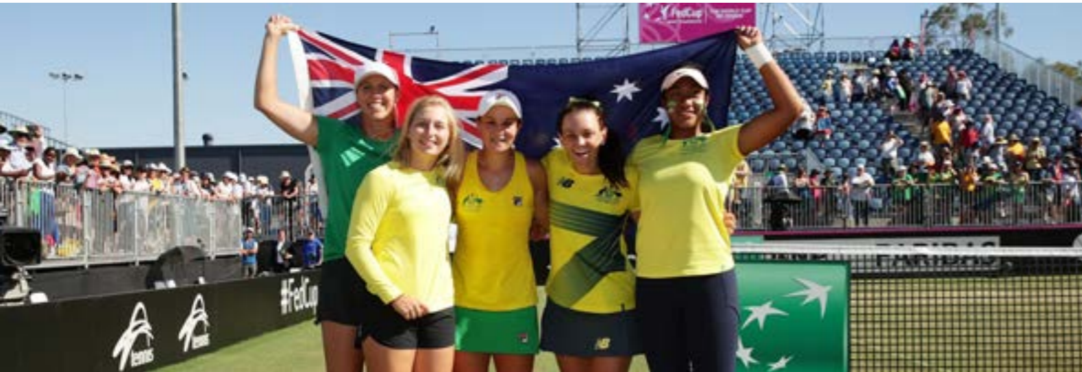
Federation Cup, Ukraine vs Australia, Canberra, 2018.

“I’m just a kid from Canberra. I’m not supposed to be a Wimbledon finalist... I’m honoured to go there and battle with the best... anything’s possible really”