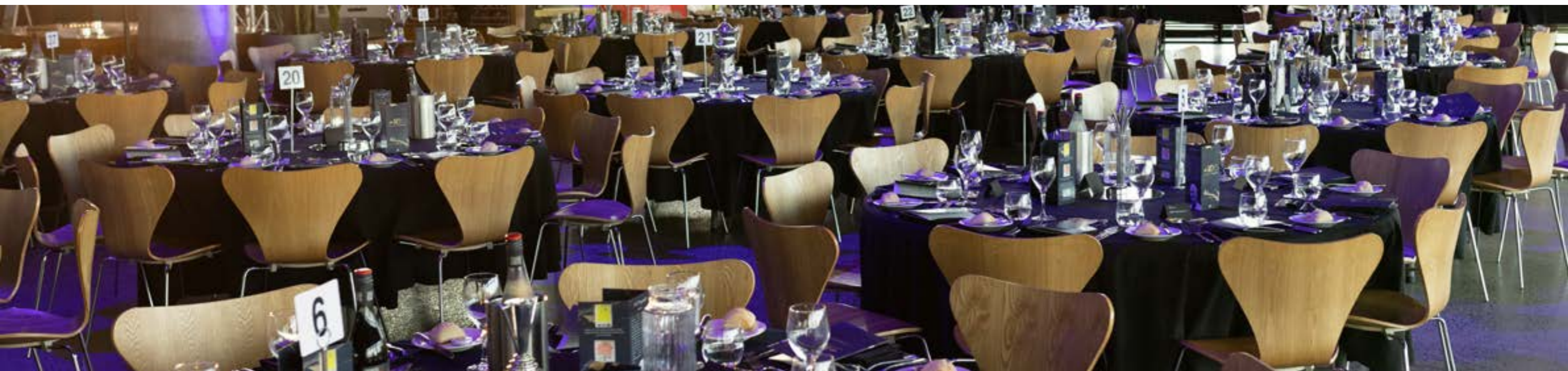
Tennis ACT Centenary Gala Dinner, March 2023.

In March 2023, Tennis ACT, and its predecessors, celebrated 100 years of organised tennis in Canberra and Region. Tennis is a sport which is integrally linked to the growth of the national capital, from infancy to a modern, cosmopolitan city of more than 460,000 people.