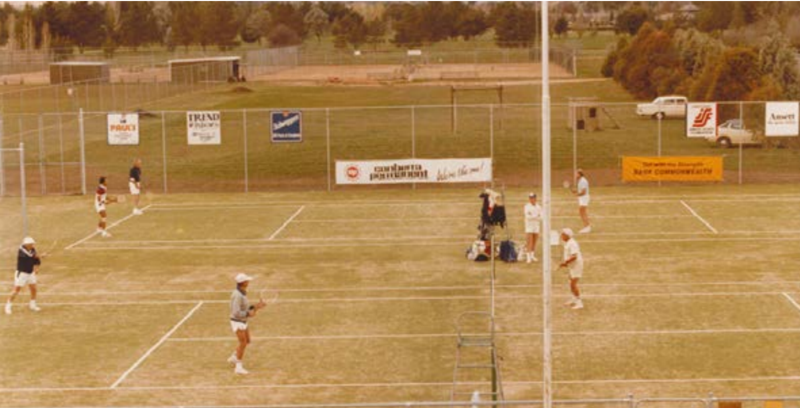
Lyneham Centre Court, 1983.

EXPANSION YEARS: OPENING UP BORDERS AND BREAKING DOWN BOUNDARIES