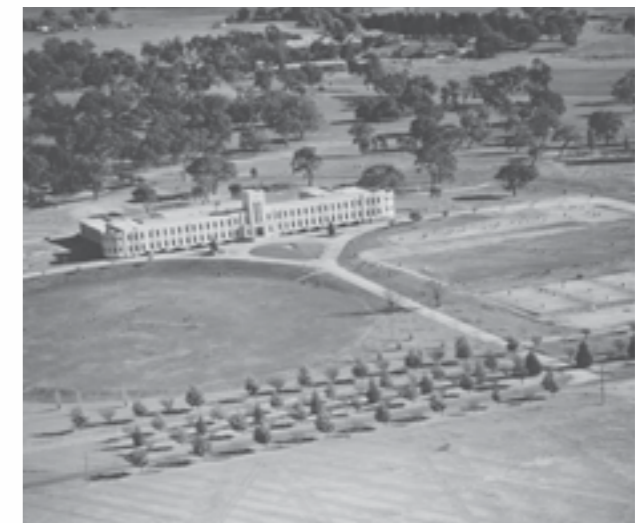
Childers St Tennis Courts, late 1950s, Source: National Archives of Australia