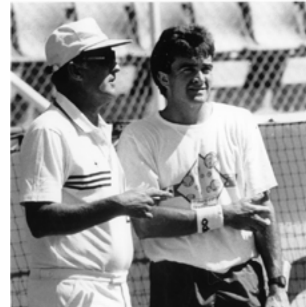
Neale Fraser and Wally Masur, Australian Davis Cup Team, 1980s.