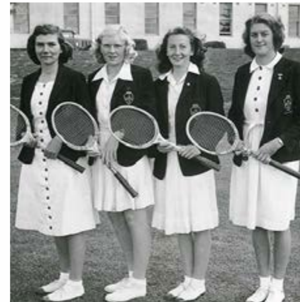
Canberra High School, Girl's Tennis Team, 1946.