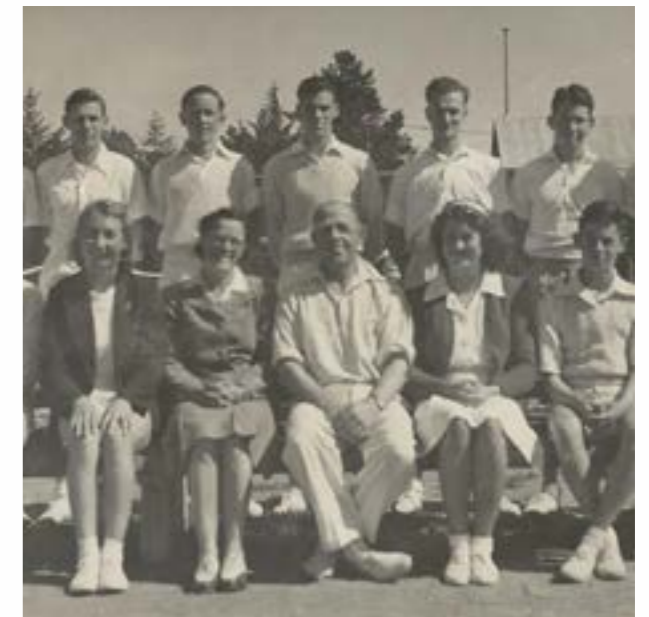
First Junior ACT Tennis Team to Visit Sydney, 1947.