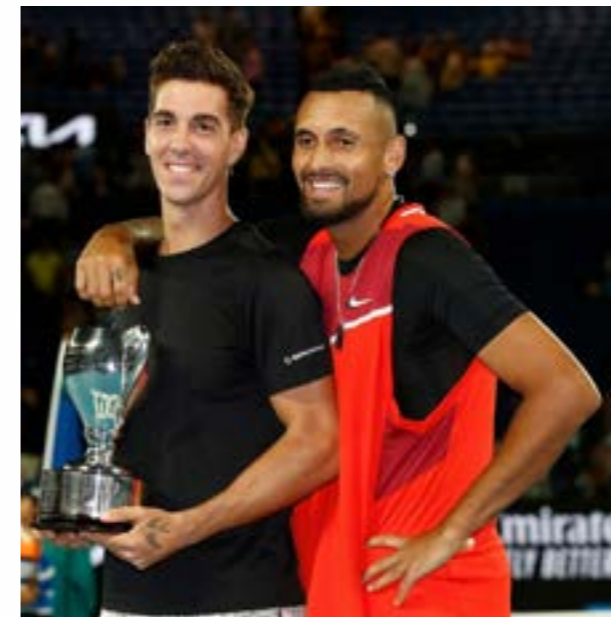
Australian Open Doubles Champions, Nick Kyrgios and Thanasi Kokkinakis, 2022.