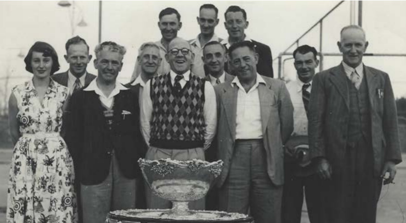
Davis Cup 'visits' Canberra for first time, ACT Open, 1951.

The expansion of the War into the Pacific with the bombing of Pearl Harbour in December 1941, then the Japanese advance through Papua and New Guinea brought dramatic changes to the Canberra tennis scene in 1942.