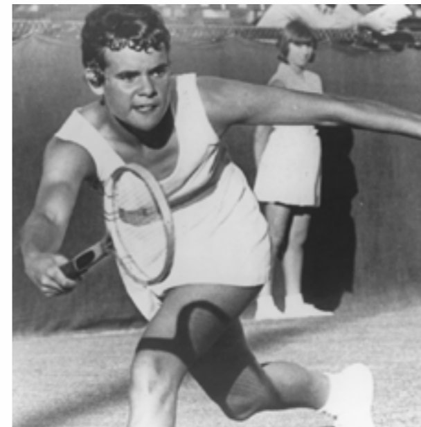
Evonne Goolagong, winner ACT Open Womens Singles, Manuka, 1969.