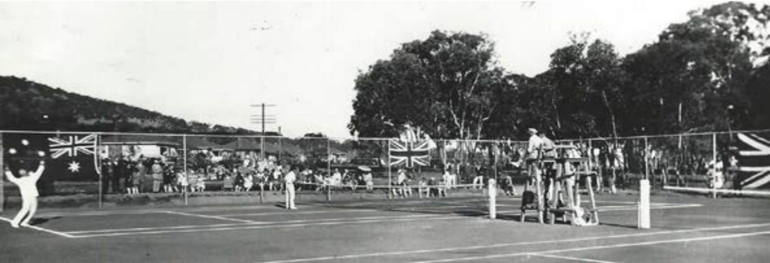
Opening of Ainslie Tennis Courts, 1928.

AN ASSOCIATION OF TENNIS CLUBS AND A COMPETITIVE SPORT