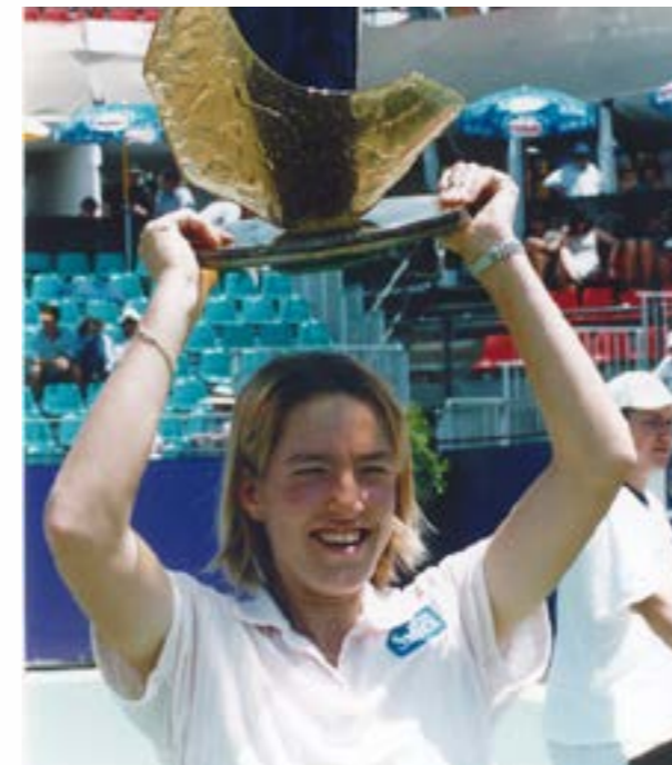
Justine Henin, winner of Canberra International, Lyneham, 2001.