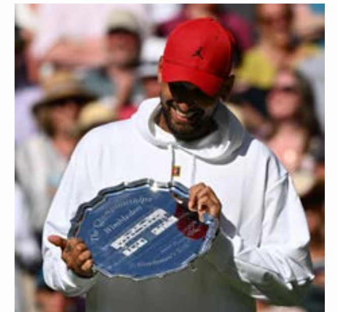
Wimbledon Mens Singles Finalist, Nick Kyrgios, 2022.