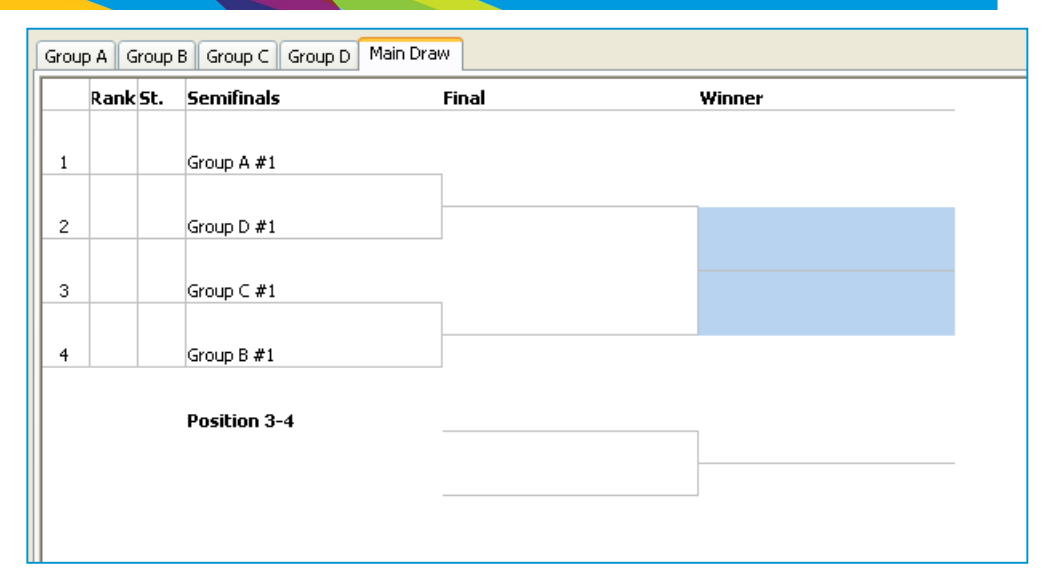
Figure 4: An example of an elimination main draw after the winners of the preliminary round-robin were determined (NOTE: This is relevant for a 16-player main draw).